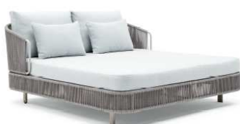
1420A Daybed CONFORT CONFORT Daybed

Collection in powder coated aluminum frame and hand woven man-made fibre. Cushions in "Dryfeel" outdoor foam.